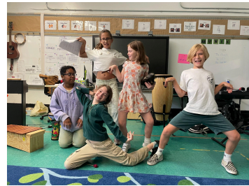
The Dodo Birds